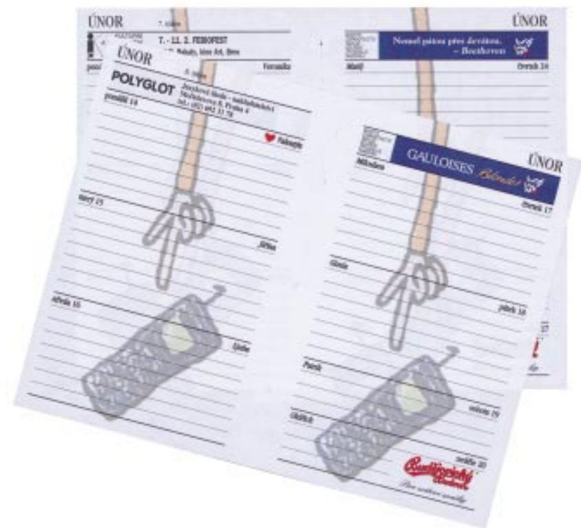
A "student diary" distributed free in the Czech Republic, bearing advertising for the Gauloises cigarette brand, Gauloises Blondes, both on the cover and on all the top right hand pages within the diary. Opposition from medical faculty members at universities in Prague and Brno managed to limit the distribution of these diaries.

But despite DownTown's intentions, not all students received the gift. Members of staff at Masaryk University in the southern city of Brno noticed that the top of all the right-hand pages of the diary was adorned with a coloured band showing the logo of the French cigarette brand Gauloises Blondes. In addition, each coloured band carried, alternately, a quotation from a famous person, or the brand's name. Appalled by the temerity of the scheme,