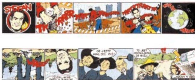
Cartoon strip run by Philip Morris Polska in a popular Polish TV guide.