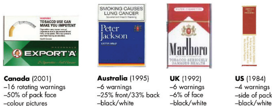
Figure 1 Cigarette package warning labels of the four countries (Canada, Australia, United Kingdom, United States) participating in the International Tobacco Four Country Survey (as of 2002).

first warning labels in 1972. 28 Cross-sectional surveys conducted in Canada during the 1990s found that the majority of smokers reported that package warning labels are an important source of health information and have increased their awareness of the risks of smoking. 11–29 In Australia, Borland 30 found that, relative to non-smokers, smokers demonstrated an increase in their knowledge of the main constituents of tobacco smoke and identified significantly more disease groups following the introduction of new Australian warning labels in 1995. However, considering the importance of health warnings among tobacco control policies, there is a need for additional research. In particular, there is a need for research that can help policymakers to choose the size and general strength of health warnings from within the general recommendations outlined in the FTC.