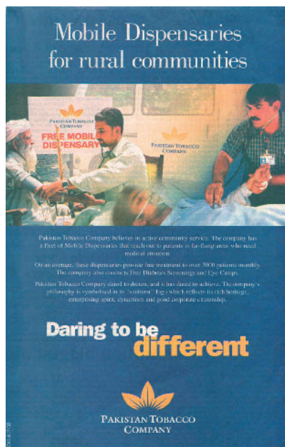
One of several advertisements appearing in newspapers in Pakistan extolling the virtues of the Pakistan Tobacco Company (PTC), the local subsidiary of British American Tobacco.

As in all the ads, the copy under the mobile dispensary picture ended, "PTC dared to dream, and has dared to achieve". It is true, of course: PTC/BAT has dared to be different, and has dared