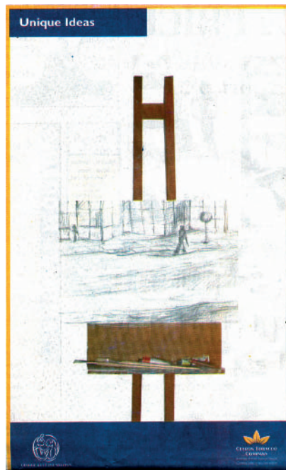
BAT advertisement for the George Keyt Foundation—"they are ruthless people".