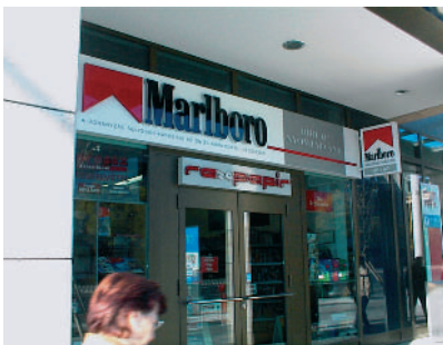
The ubiquitous Marlboro logo, now being forced off the streets in Hungary.

The result was disappointing for tobacco control advocates and for those who were committed to controlling tobacco through administrative means. Again, tobacco advertisements became