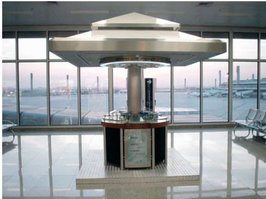
BAT's "Smoking point" which was recently banned from Rio de Janeiro's airport.

"When my father was living, too, the manner in which they treated my father was not right. The Foundation had power to the extent to control my father. Soon after his death they just stopped the allowance due to my mother and she was very disappointed. After a couple of months she too passed away. When my father was alive they took away his entire valuable, old paintings, which he had dearly collected for years. They said they wanted to sell them for the maintenance of the Foundation. But what is the Foundation doing now? They