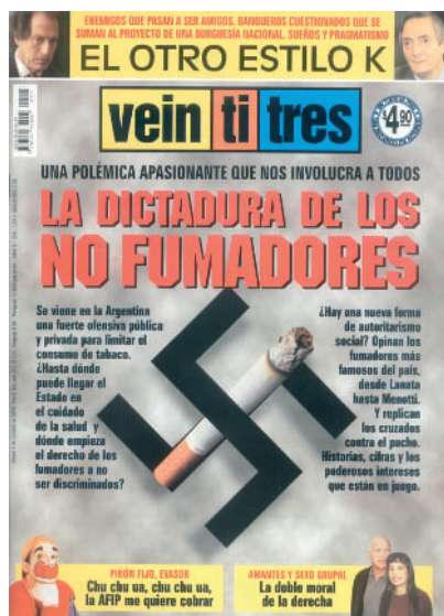
Cover of the Argentine magazine Veintitrés , bearing a swastika under the title “The non-smokers’ dictatorship”.

A state wide survey by San Jose State University has shown that Californians with health insurance overwhelmingly support the inclusion of smoking cessation treatment in standard health insurance coverage. Seventy one per cent believed medications and programmes to help smokers quit should be part of standard health benefits, and 72% agreed that employers should offer employees insurance that includes coverage for stop-smoking benefits. Despite