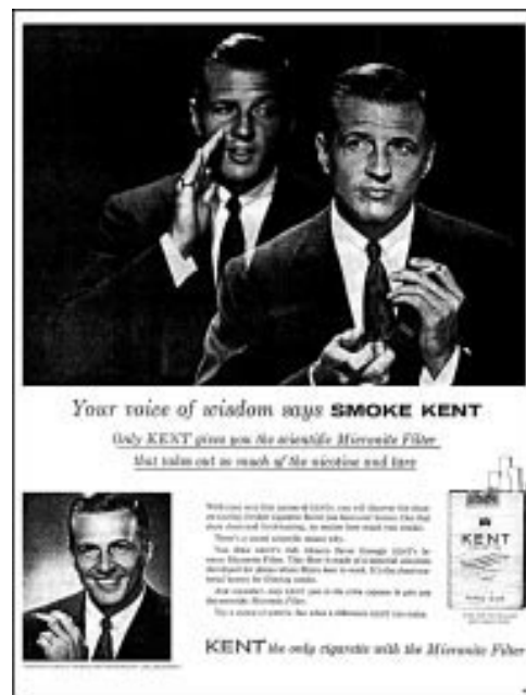
Figure 4 Kent: "Voice of Wisdom" (1955).

"While unquestionably smokers are concerned about the tar and nicotine contents and the filtration effectiveness of their brands, nevertheless, both on the surface and even to some extent unconsciously, they appear to be resisting open involvement with this 'frightening' element of smoking". 17 Some brands were less successful than others when trying to address consumer conflicts directly. Kent, for example, used a