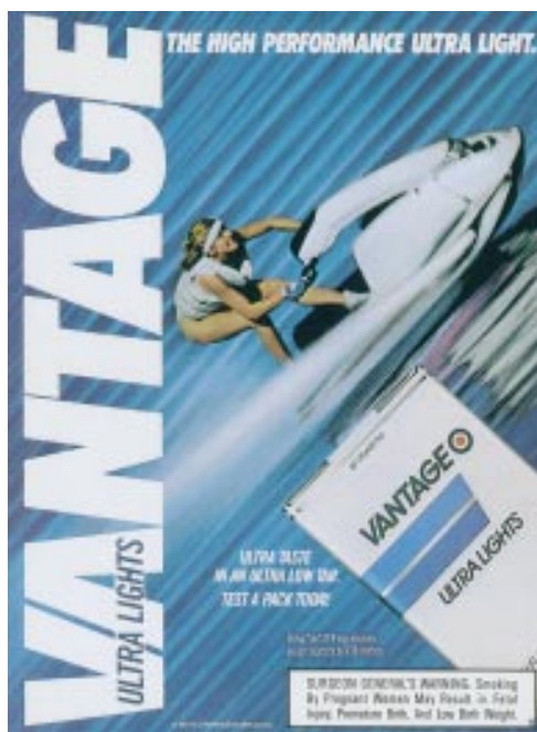
Figure 14 Vantage “energetic action” photography (1987).

offered some benefits, namely prospects for greater stability and the appearance of governmental approval of their products by official testing procedures (“for example, by capitalizing on official tar and nicotine ratings in cigarette advertising”). 86