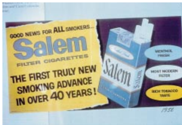
Figure 3 Salem: "First Truly New Smoking Advance" (1956).

Oasis, and Salem (fig 3). These capitalised on the reputation menthol had within cough and cold remedies, and the history of health claims made by earlier advertising for unfiltered menthol brands like Spuds and Kool. "Menthol styles were perceived as healthier, low 'tar' smokes due to the quasi-medical health claims in menthol advertising". 12