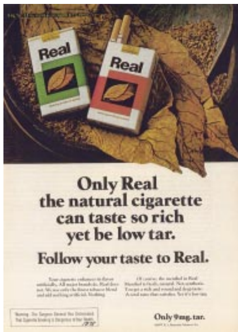
Figure 8 Real "Natural" (1977).

special needs of smokers . . . NOW: Lowest tar and sophistication. Our efforts were highly targeted in terms of advertising copy, media, point-of-sale, and consumer sampling . . . Against the highly concerned urbane smoker". 57