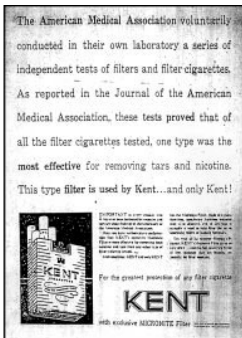
Figure 1 Kent: implied American Medical Association endorsement (circa 1953).

Health Protection", L&M's "Just What the Dr. Ordered", Embassy's "Inhale to your Heart's Content", Life's "The Secret to Life is in the Filter", and Parliament's "Extra Margin" (of safety protection, implied by analogy to helmets, seat belts, and other safety gear). Other ad slogans, such as Viceroy's "Thinking Man's Filter" or "Delivers more of what you smoke a filter for", were even more implicit yet still begged for health inferences by consumers. 3