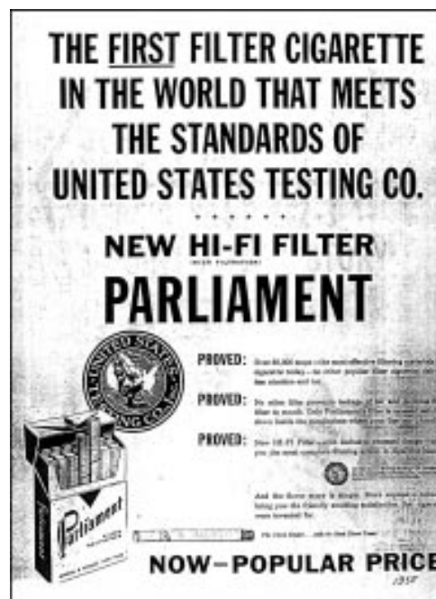
Figure 2 Parliament: endorsement of United States Testing Co (1958).

Consumer adoption of filters in the 1950s was related to education and social class. "People who smoke filter cigarettes, have higher occupational status and income, are more consciously in conflict about smoking". 7 Sex and age, however, were even more consistent predictors of who adopted the new filtered products. Women adopted filters more readily than men, and older concerned smokers more readily than young starters. 8