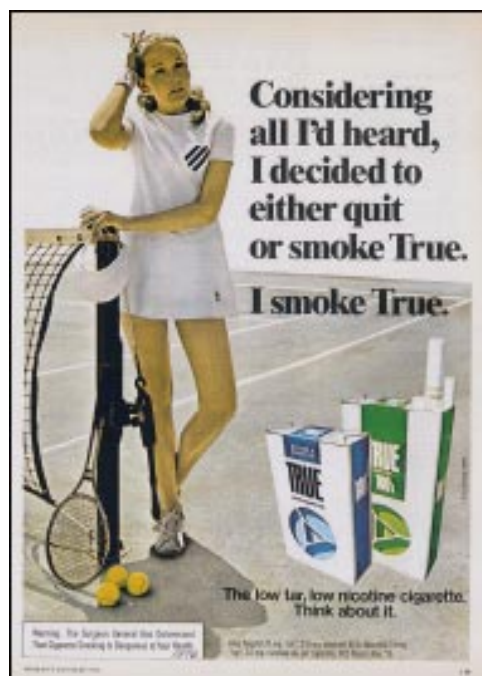
Figure 10 Quit or smoke True as equivalent options (1976)

B&W articulated the dual objectives of good advertising—providing reassurance about healthfulness (without, of course, doing so in a heavy handed way to induce defensiveness) and also providing a socially attractive brand image the smoker could acquire when buying and displaying the package. "Good cigarette advertising in the past has given the average smoker a means of justification on the two dimensions typically used in anti-smoking arguments: 1. High performance risk dimension . . . 2. Ego/status risk dimension . . . For some smokers reduction in physical performance risk is paramount, for others reduction in 'ego/status' risk comes first . . . All good cigarette advertising has either directly addressed the anti-smoking arguments prevalent at the time or has created a strong, attractive image into which the besieged smoker could withdraw" [emphasis in original]. 74