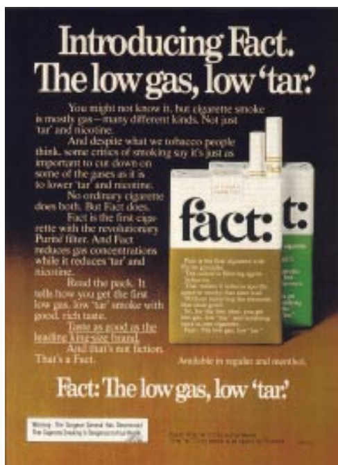
Figure 6 "Introducing Fact. The low gas, low 'tar'".

as compared to Philip Morris' sudden national blitz for Merit . . . Fact is directed to the educated, concerned smoker. Our copy is straightforward and direct, and there is no gender differentiation or symbolism". 48 Fact was using the Purite filter to filter gases from the smoke column, but needed to first inform consumers that gases were an issue. Their initial effort was test-marketed, but did not perform well in the marketplace, despite advertising support of about $30 million over 1976-77 (fig 6). The senior brand manager of B&W explained: "The low gas benefit of the product wasn't of interest to the public, and wasn't understood. The advertising and packaging failed to reinforce the flavor aspect of the brand . . . The package was perceived by customers as medicinal, like a prescription bottle of Geritol. The tar level wasn't low enough by mid-1976 to allow it to be a talking point in advertising". 49