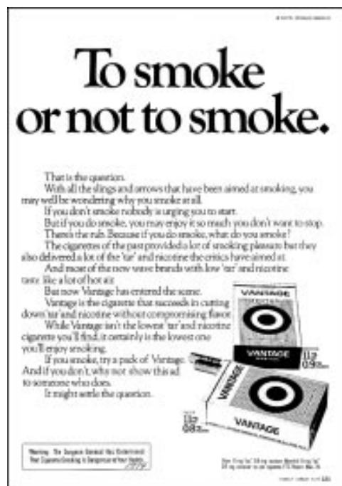
Figure 13 Vantage "To smoke or not to smoke" (1974).

Images and ad copy had to be carefully selected, lest the ads reinforce fears rather than offer reassurance. In 1980, one Vantage ad made direct reference to "what you may not want" from a cigarette, only to discover that it alarmed some readers about cancer. "The fact that a Vantage ad dares to raise the issue of 'what you may not want' generates defensiveness