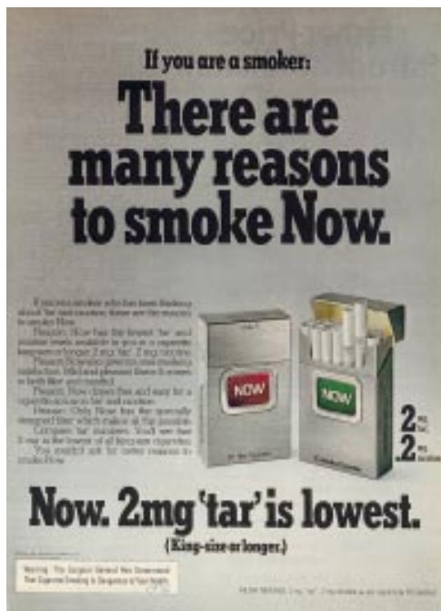
Figure 9 "There are many reasons to smoke Now" (1976).

The high stakes in the competition within the cigarette trade led to extensive testing of new products and their marketing before committing to full deployment. The care with which even line extensions of familiar products were executed is seen in the efforts of RJR in preparing to introduce Camel Lights. This new product variation was tested in six cities in a multivariable experimental design testing three advertising