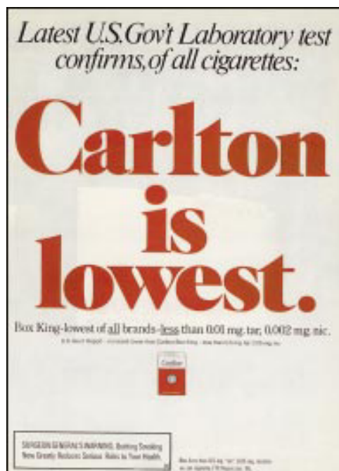
Figure 11 Carlton Box "phantom brand" (1985).

"Merit smokers are more conventional. They are not ordinary or humdrum, but their personalities are not as multi-dimensional. Their self-assurance operates up to certain limits; they avoid going beyond these limits for fear of losing control. They do not have as strong a sense of self. They count on others for help and guidance. Being less fiercely independent, they are more people oriented, more responsive to established values and standards". 80