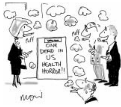
Figure 2 Cartoon by Alan Moir, which appeared in the Sydney Morning Herald

Alan Moir's telling cartoon (fig 2), published in the Sydney Morning Herald in the first days of the anthrax mailings in the USA, shows a group of smokers reading the banner coverage of a single death attributed to anthrax. As we go to press, five people have died as a result of anthrax inhalation. Figure 3 shows an anti-smoking poster plainly appropriating the New York twin towers outrage. Accompanied by a simple call for "No more killing", two upturned cigarettes burn in the shape of the World Trade Center before their collapse. Produced in Hong Kong by graphic artist Michael Miller Yu and designer Eric Chan, tobacco control groups there and elsewhere refused to endorse it, branding it