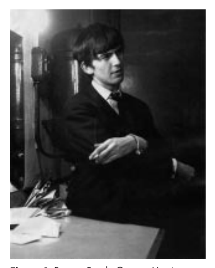
Figure 1 Former Beatle George Harrison, who died 29 November 2001 from tobacco induced cancer.

Tobacco control advocates have long tried to make smoking statistics resonate with a public numbed by endless quantification rhetoric advanced by myriad interest groups. Annual tobacco deaths in different nations have been routinely compared with deaths from so many