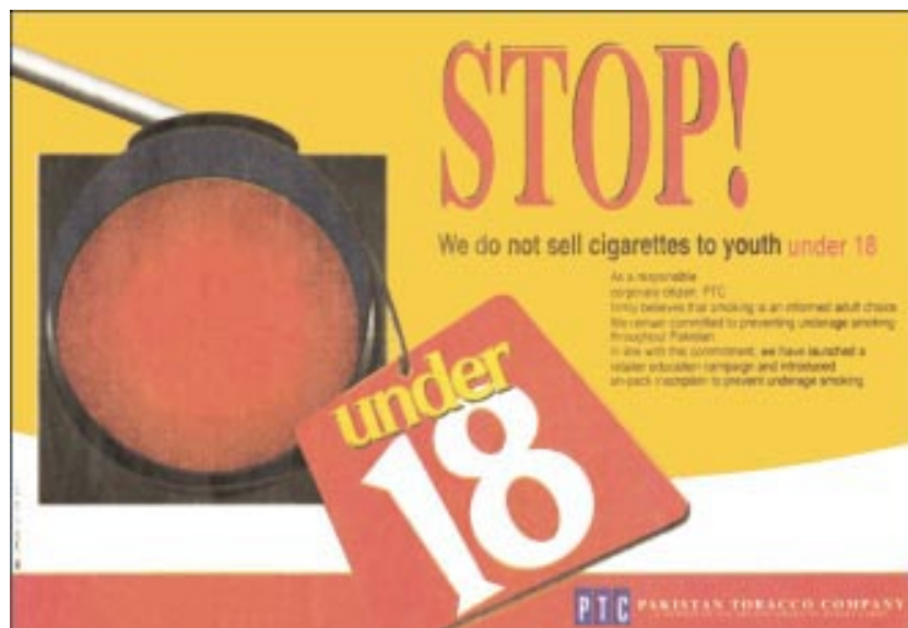
The "Stop!" advertising campaign being run by the Pakistan Tobacco Company (a subsidiary of BAT), declaring that "As a responsible corporate citizen, PTC firmly believes that smoking is an informed adult choice".

Lest any of this excess should nudge the government into thinking about legislation, the leading companies, BAT and Lakson, have produced their own self regulatory code of conduct on tobacco promotion and sales. Predictably, it is a compilation of the most ineffective measures developed over years of successful efforts to prevent or delay legislation in the west. Ensuring maximum effects on both opinion leaders and children, BAT has added the usual advertising campaign proclaiming its youth education programme, complete with repeated emphasis on the belief of this "responsible corporate citizen" that smoking is "an informed adult choice". It has even introduced "on-pack inscriptions" to prevent under-age smoking". This will be a great relief to Pakistani parents. No doubt any errant child who foolishly picks up a pack of cigarettes made by