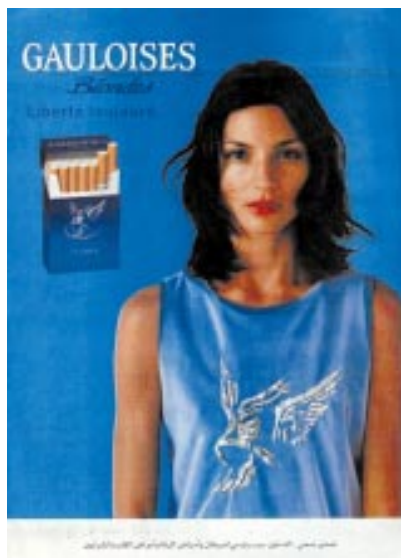
Gauloises advertisement now appearing in Middle Eastern countries, carrying the slogan "Liberté Toujours" (Always Freedom).

and attended a briefing the following week. Several were not regular smokers, but £50 for simply "dressing glamorous" and mingling, being charming, buying drinks, offering cigarettes, and above all, smoking, seemed too good to resist. If appropriate, they were told, they could offer whole packs of cigarettes, and leave them lying around on unoccupied tables. The priority, it was made clear, was that Gauloises should be associated with youth and glamour.