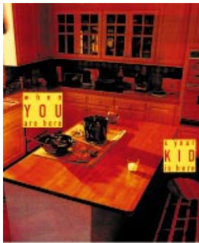
The Philip Morris advertisement in the November 2000 edition of "Good Housekeeping".

At the front of the November 2000 edition, beside a photograph of the editor, was a trailer for what was