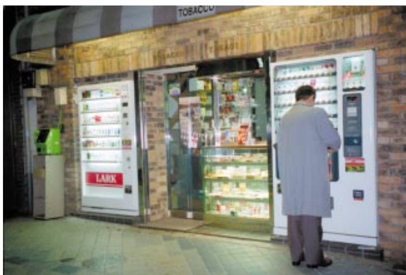
Cigarette vending machines on the streets of cities in Japan, like these ones seen in Kobe last November, make access easy for children.

Statistics make the story obvious. Japan's Tobacco Problems Information Centre estimates that minors consumed approximately three billion packs of cigarettes in 1996. This translates to roughly eight million packs obtained by minors each day. If late night vending machine operations