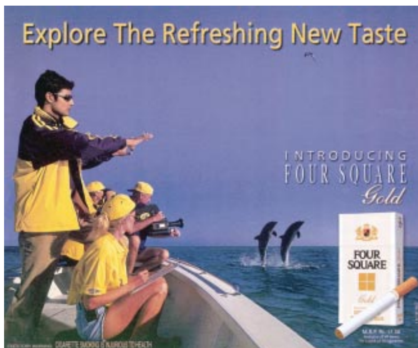
India: who's boss in the new world order? Look who's boss now. This advert for a new brand launched by Godfrey Phillips, a Philip Morris subsidiary, portrays a young Indian film director at work on a film shoot. The members of his crew are westerners, and the advert appears to exploit national pride in India's internationally successful movie industry. The cigarette makers said the setting of the advert, an adventurous and challenging shoot on water, fitted with the core brand values of daring dynamism with a spirit of outdoor adventure.