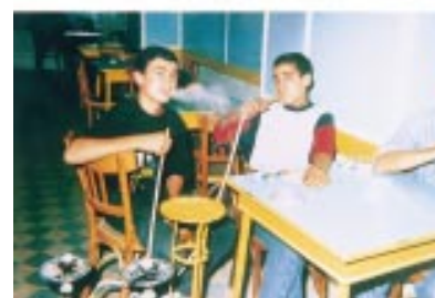
Syria: nargileh makes a comeback. Smoking nargileh (hubble bubble), a habit formerly confined mostly to older Syrian men (top), has recently started to attract wider usage, including at women's gatherings, and among teenagers (bottom).

of Bangladesh, and the long established tobacco control organisation ADHUNIK.