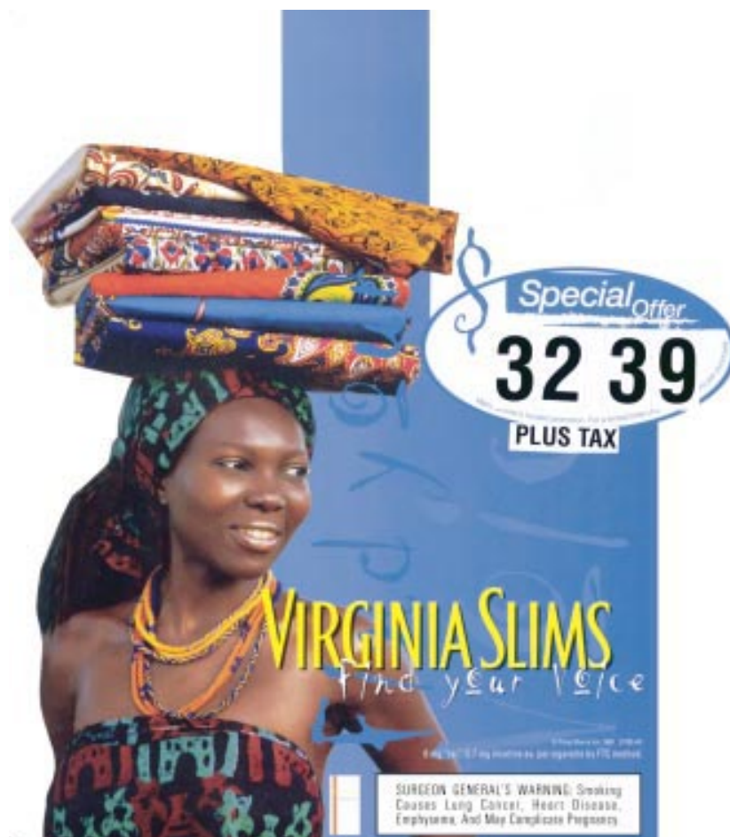
USA: Virginia Slims find your voice campaign. In what appears to be an appeal to back to roots sentiments, this advert portraying a woman in Africa is thought to be aimed at US African American women. It contrasts with cigarette advertising in African countries where western, especially American, models are often featured.

The attitude of the American delegation at the WHO consultative technical conference on the FCTC in New Delhi from 7 to 9 January 2000