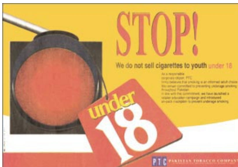
The "Stop!" advertising campaign being run by the Pakistan Tobacco Company (a subsidiary of BAT), declaring that "As a responsible corporate citizen, PTC firmly believes that smoking is an informed adult choice".

Lest any of this excess should nudge the government into thinking about legislation, the leading companies, BAT and Lakson, have produced their own self regulatory code of conduct on tobacco promotion and sales. Predictably, it is a compilation of the most ineffective measures developed over years of successful efforts to prevent or delay legislation in the west. Ensuring maximum effects on both opinion leaders and children, BAT has added the usual advertising campaign proclaiming its youth education programme, complete with repeated emphasis on the belief of this "responsible corporate citizen" that smoking is "an informed adult choice". It has even introduced "on-pack inscriptions" to prevent under-age smoking". This will be a great relief to Pakistani parents. No doubt any errant child who foolishly picks up a pack of cigarettes made by