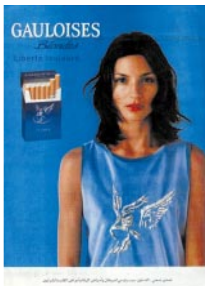
Gauloises advertisement now appearing in Middle Eastern countries, carrying the slogan "Liberté Toujours" (Always Freedom).

and attended a briefing the following week. Several were not regular smokers, but £50 for simply "dressing glamorous" and mingling, being charming, buying drinks, offering cigarettes, and above all, smoking, seemed too good to resist. If appropriate, they were told, they could offer whole packs of cigarettes, and leave them lying around on unoccupied tables. The priority, it was made clear, was that Gauloises should be associated with youth and glamour.