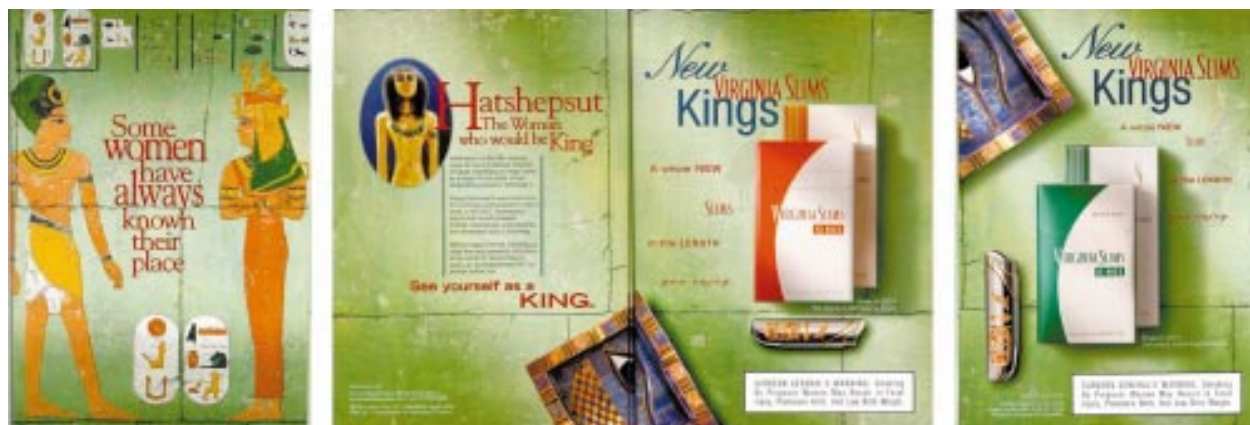
The latest ad campaign by Philip Morris targeted at female smokers—"See yourself as a king".