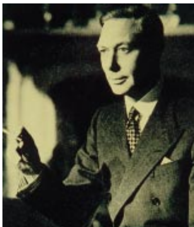
King George VI, the father of Britain's current monarch, smoked from the age of 14, had a cancerous lung removed in his early 50s, and died of heart disease at the age of 56.

This is the brand aimed at "young adult female smokers", as its advertisers would probably say, or girls, as cynical health experts might prefer to describe the target audience. Virginia Slims advertisements have irritated feminists and health advocates alike since the earliest ads informed women, whom they addressed as "Baby", that they had "come a long way". Whereas it had been taboo for their mothers' generation to smoke, they suggested, it was now OK to smoke, and a symbol of their new, hard won independence. After a drubbing from leaders of the women's movement, whose concern at that