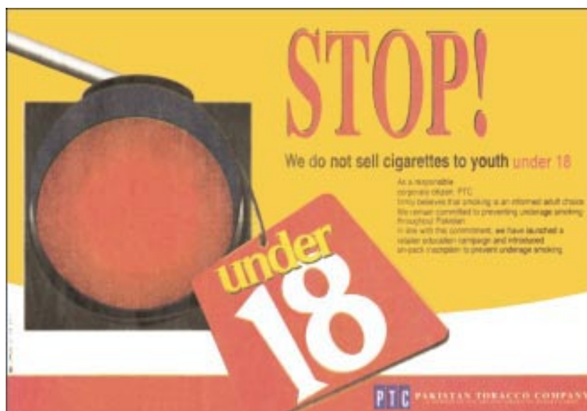
The "Stop!" advertising campaign being run by the Pakistan Tobacco Company (a subsidiary of BAT), declaring that "As a responsible corporate citizen, PTC firmly believes that smoking is an informed adult choice".

Lest any of this excess should nudge the government into thinking about legislation, the leading companies, BAT and Lakson, have produced their own self regulatory code of conduct on tobacco promotion and sales. Predictably, it is a compilation of the most ineffective measures developed over years of successful efforts to prevent or delay legislation in the west. Ensuring maximum effects on both opinion leaders and children, BAT has added the usual advertising campaign proclaiming its youth education programme, complete with repeated emphasis on the belief of this "responsible corporate citizen" that smoking is "an informed adult choice". It has even introduced "on-pack inscriptions" to prevent under-age smoking". This will be a great relief to Pakistani parents. No doubt any errant child who foolishly picks up a pack of cigarettes made by