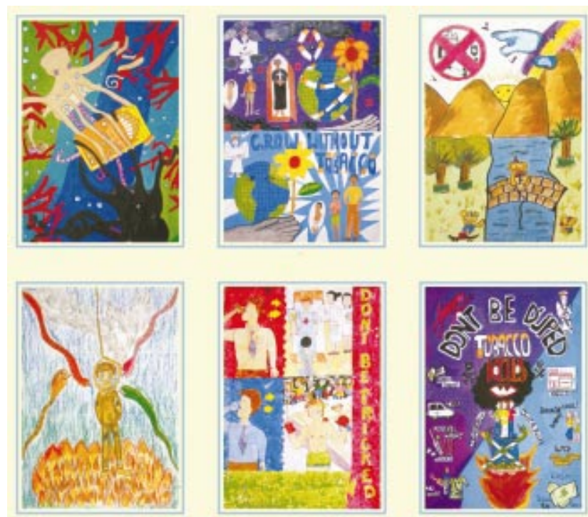
Part of a calendar produced by the Royal & Sun Alliance Insurance company in aid of the Pakistan Cancer Society. Each two month spread features anti-smoking posters designed by children.

Redheads, the largest selling brand of matches in Australia. The manufacturers launched an art competition, targeted at school children, to design a new image for the redheaded woman