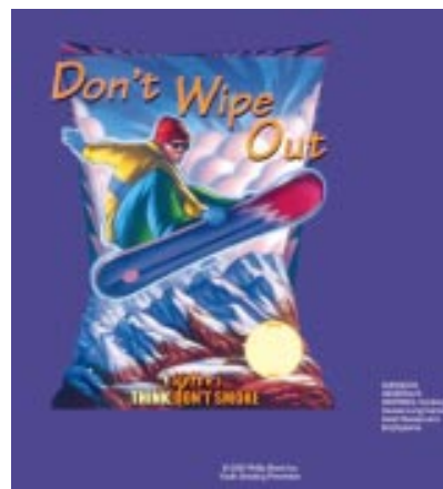
The Philip Morris book covers distributed to schools.

The sponsorship of school book covers is common practice with companies who market to children. It is usually seen as a win-win situation. The school gets needed protection for its precious resources, and children get an average of 5.5 months exposure to the company's name and image. Even better, from the viewpoint of Philip Morris, Primedia Cover Concepts, which distributes the book covers, has the capability to target particular audiences. If, for example, a company seeks to increase its sales among young Hispanics, suitable schools can be identified for distribution of the relevant covers. The criteria by which schools were chosen to receive Philip Morris covers is not clear and may not have been a random process.